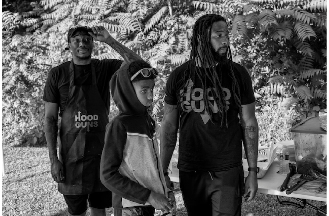
Photo taken at protest by SNUG (guns spelled backwards), an organization in Poughkeepsie, NY addressing gun violence

Upon my retirement a few years ago, I found myself reminiscing years past when I was deeply involved in street photography. In my creative absence, the world became digitalized and though still around, film photography has gone the way of vinyl records and audio tapes. Admittedly a person with a serious case of Gear Acquisition Syndrome, my venture into purchasing a camera introduced me to the world of digital photography.