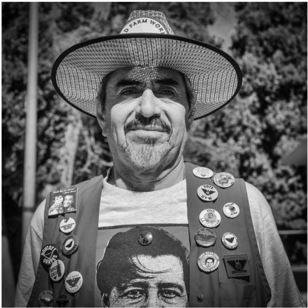
Farmworker March, Sacramento, 2022