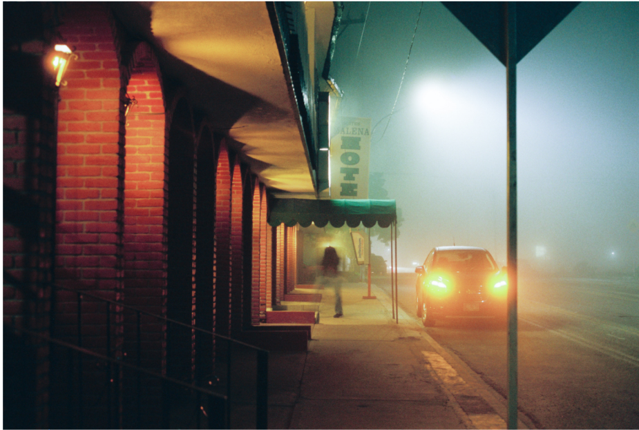
The Visit, 2017 35mm, digital scan Carlos Morales (Ensenada) @charlymorse