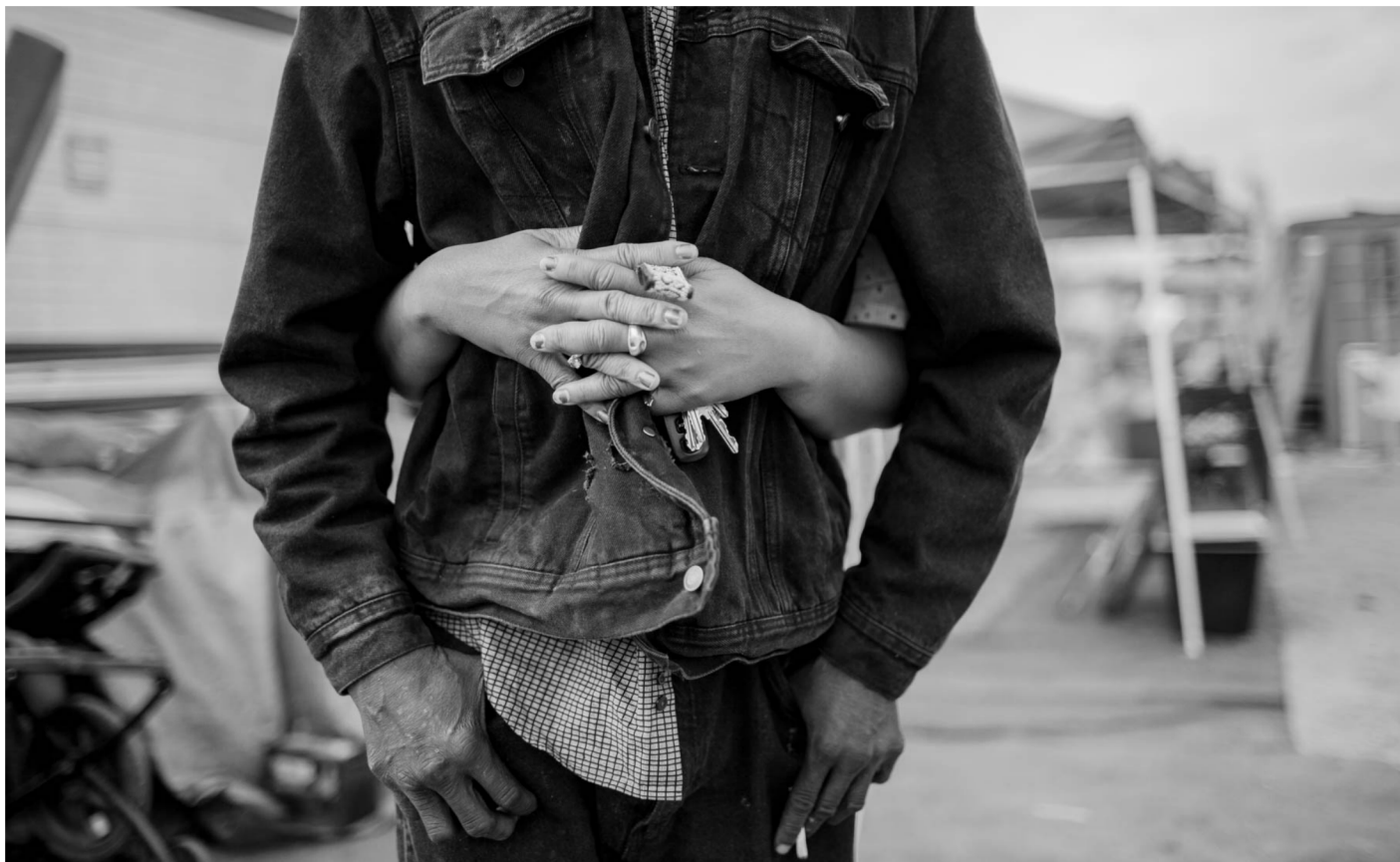
Residents of Wood St, 2022. They are being evicted from the encampment

very little time to move it all away. He was also told that he had a space to move his RV into and a new storage locker.