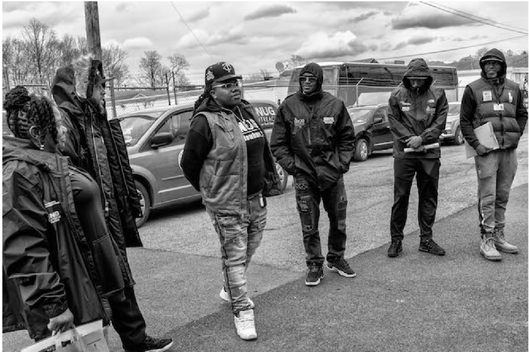
Photo taken at protest by SNUG (guns spelled backwards), an organization in Poughkeepsie, NY addressing gun violence

perspective. The Silver Efex Pro controls and lever provide a wide range of options for enhancing black and white images. Though not the nostalgic darkroom days of chemical, trays, muted lighting and timers, the ability to move through a full range of editing programming dedicated to defining contrast and integrating the myriad of tones and shading which make black and white photography communicate the visual stories and maintain its place in the field of creative arts, is a pleasure.