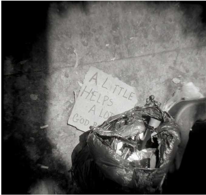
Discarded "help sign" in MacArthur Park in Los Angeles, CA. According to the Greater Los Angeles Homeless count, 69,144 people experience homelessness in the county