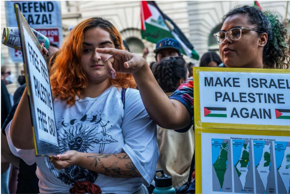
Four thousand demonstrators from throughout the San Francisco Bay Area protested in front of the Federal Building the Israeli bombing of Gaza and demanded a ceasefire. San Francisco, CA 19 October 2023