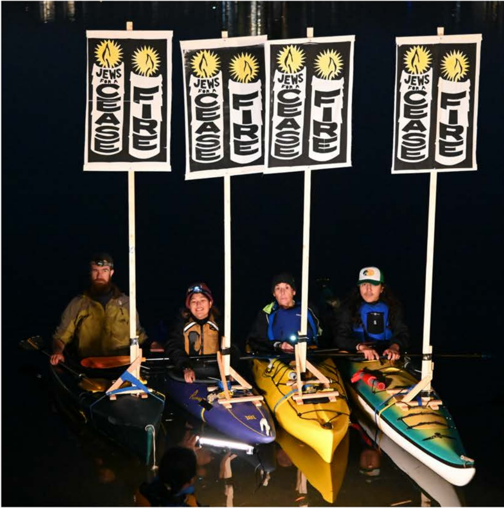
Kayakers displaying signs saying "Jews for a ceasefire" on Lake Merritt in Oakland as part of a rally organized by anti-Zionist Jewish groups at the Lake Merritt Amphitheater on 22 December 2023.