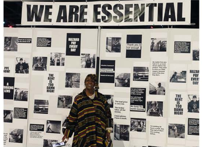
Class Conscious Photographers work as part of WE ARE ESSENTIAL installation at the Golden 1 Center, Sacramento, CA.