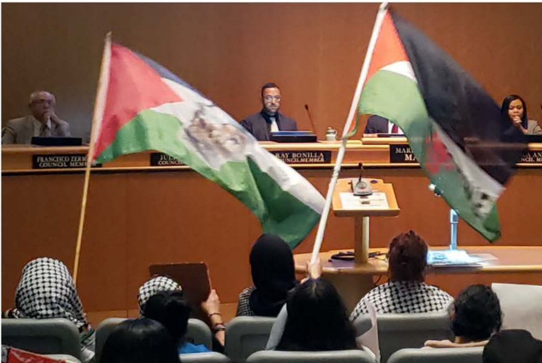
Palestinian flags wave directly in the faces of the Hayward City Council during deliberations on a resolution to divest from four companies in the city's investment portfolio that are on the BDS (Boycott, Divestment, Sanctions) list for their roles in enabling Israeli Apartheid. Overwhelming public comments in favor of the resolution persuaded city council members to pass the measure in a 4-3 vote on 23 January 2024.