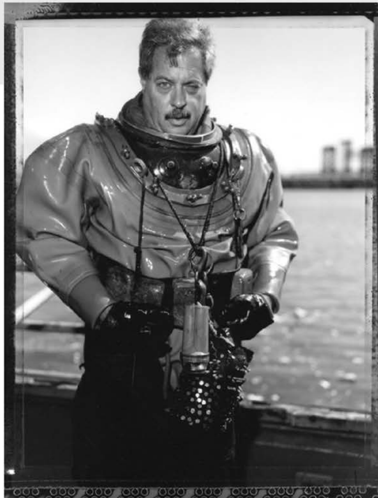
Member of Piledrivers Local 2375, Port of Los Angeles.